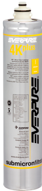
4K-Plus Replacement Cartridge: EV9612-71

Delivers premium quality water for foodservice, vending and OCS applications